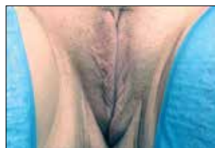
After four ULTRA Femme 360° treatments